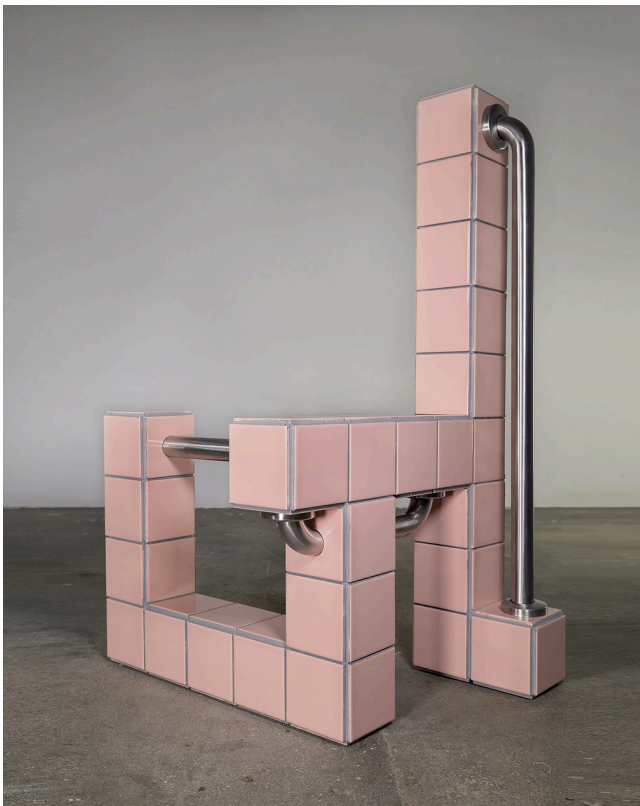
Zac Hacmon Destined, 2017 Ceramic tiles, stainless steel and wood 23"x27"x40"