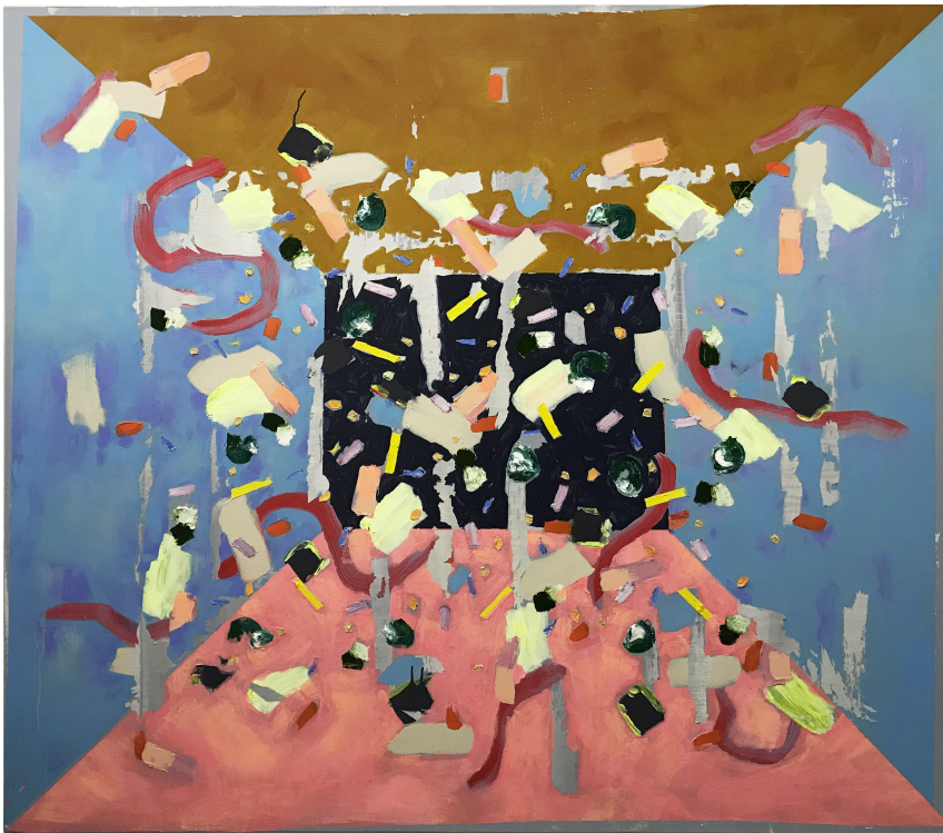
Gal Cohen A study of memory, 2018 Oil, enamel and acrylic on canvas, 72"x69"