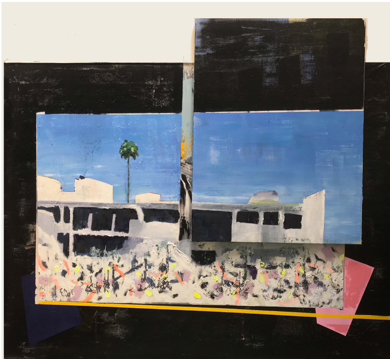
Gal Cohen Where Was Batman? #2, 2018 Oil on canvas 73"x85"