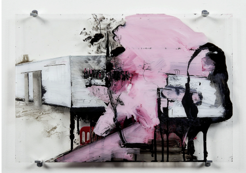
Michal Geva Untitled, 2018 Acrylic on glass 13"x19"