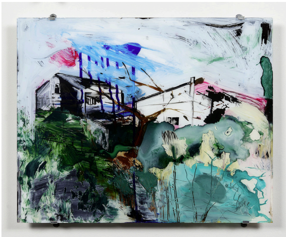
Michal Geva Untitled, 2018 Acrylic on glass 16"x20"