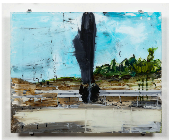
Michal Geva Road1, 2018 Acrylic on glass 16"x20"