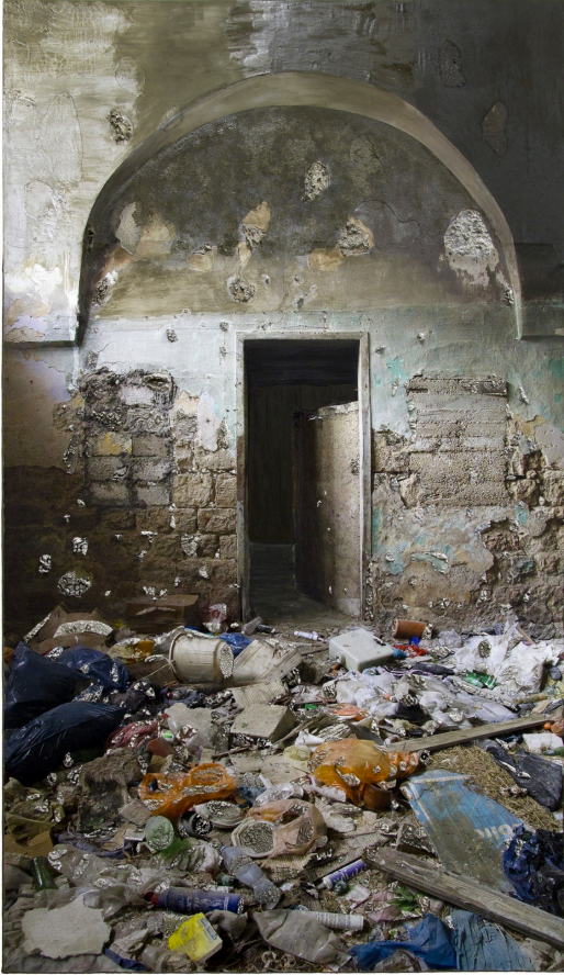
Naomi Safran-Hon Wadi Salib: Living Arrangement (Doorway with Arch), 2017 Acrylic, archival ink jet print, lace, fabric, gouache, stone spray-paint, and cement on canvas 72"x41.5"