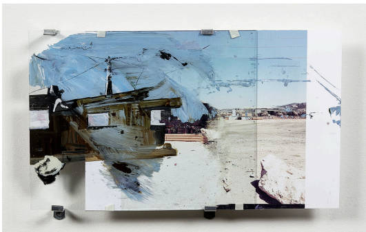
Michal Geva Untitled, 2018 Acrylic on glass and print 8"x13.5"