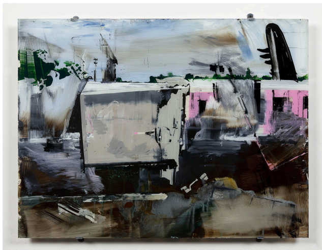
Michal Geva Untitled (pink trailer) 2018 Acrylic on glass 18"x24"