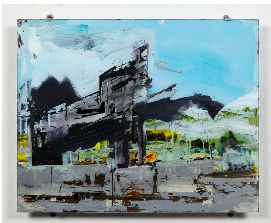
Michal Geva Untitled, 2018 Acrylic on glass 16"x20"