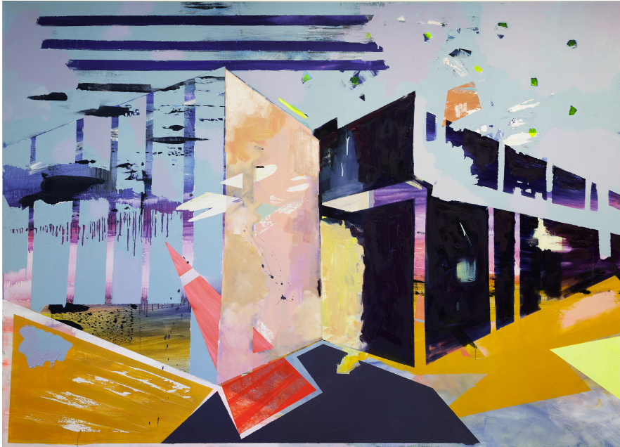
Gal Cohen Where Was Batman? 2018 Oil, enamel and acrylic on canvas 81"x60"