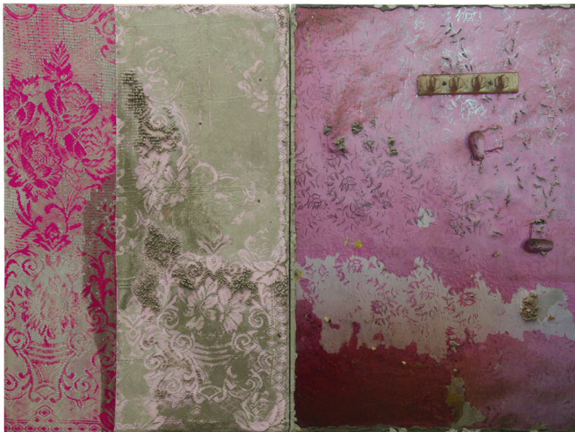
Naomi Safran-Hon Wadi Salib: Interior Wall IV (pink coat hanger), 2013 Archival ink jet print, lace and cement on fabric and canvas, 48.5" x 65"