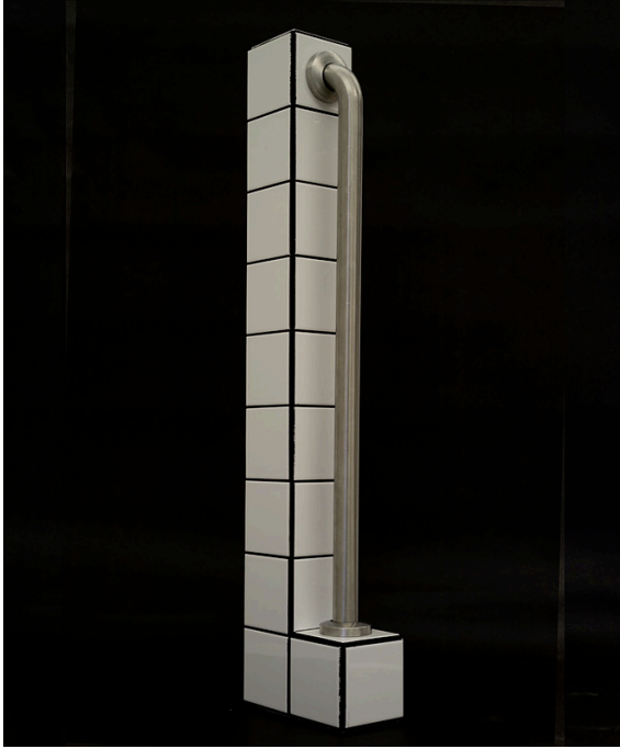
Zac Hacmon Subjectification, 2017 Ceramic tiles, wood, stainless steel 5"x9.5"x40.5"